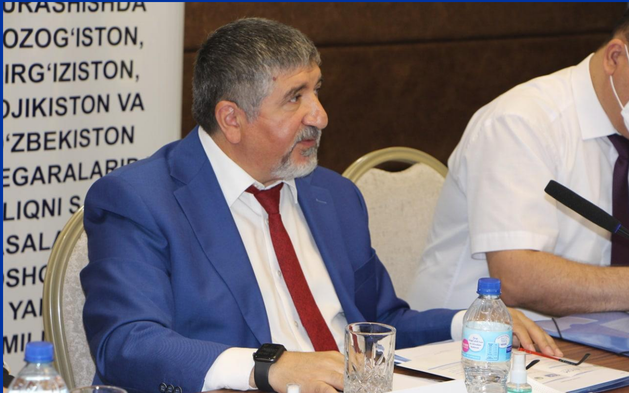
August 18, 2021

On Wednesday, August 18, the U.S. Center for Disease Control and Prevention together with the IOM conducted the Second Multi-stakeholder Round Table session on the planned Border Health Security assessment with participation of 25 attendees, including representatives from the State representatives of the Republic of Uzbekistan.