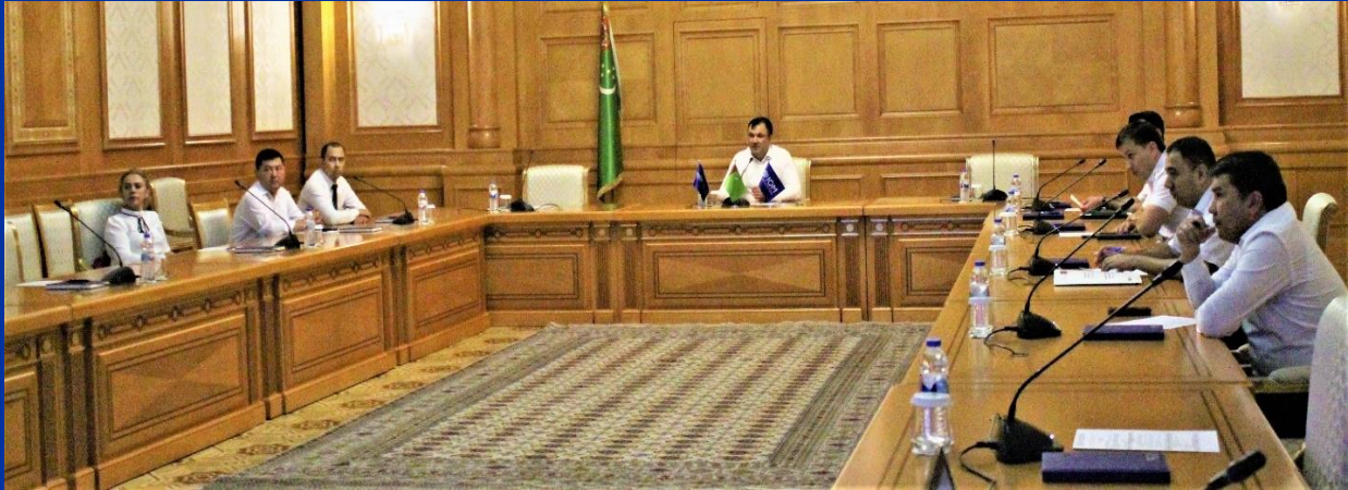
August 17, 2021

IOM Mission in Turkmenistan in partnership with the Ministry of Foreign Affairs and State Migration Service of Turkmenistan organized a seminar on implementation of the Advance Passenger Information (API) systems. This seminar was conducted within the framework of the regional project "Implementation of the Advance Passenger Information (API) system in Central Asia", funded by the IOM Development Fund and focused on cooperation with the airlines.