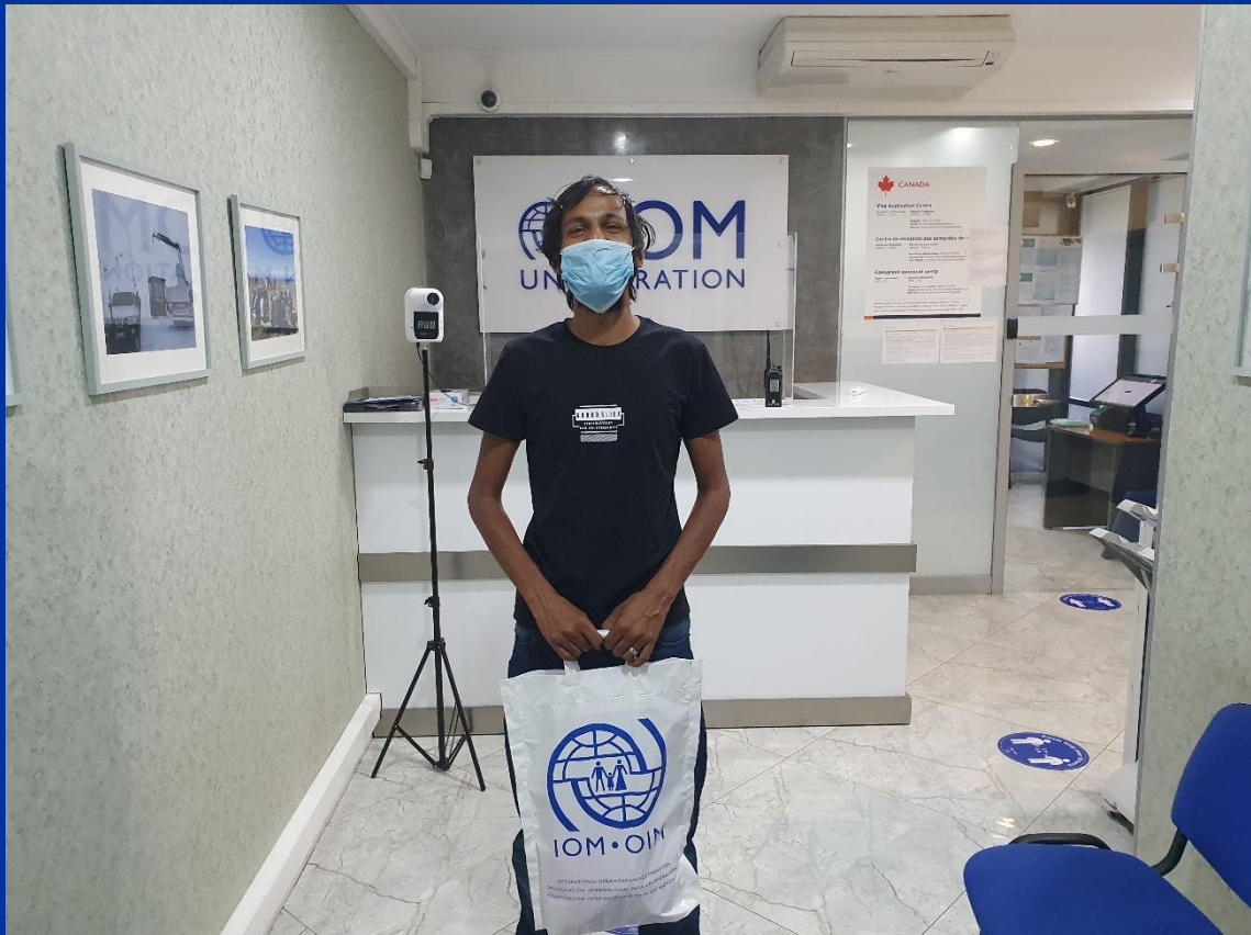
August, 2021

IOM Central Asia continues its activities on direct assistance. The activities include reintegration planning sessions, occupational training, grant items distribution, community events and awareness-raising campaigns.