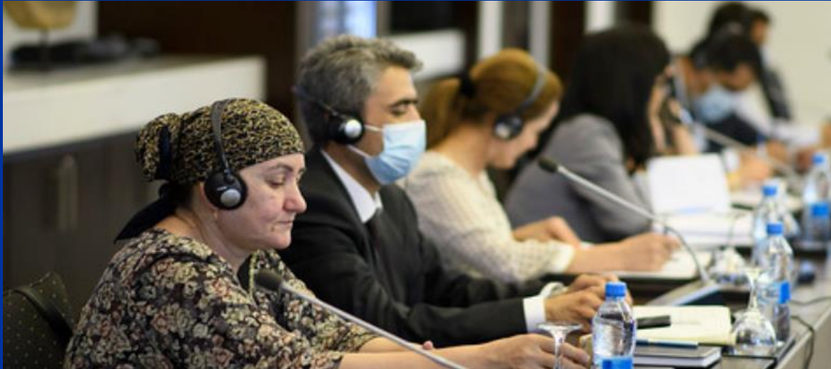
August 23, 2021

UN and the Government of Tajikistan launched the new joint initiative aiming at empowering families left behind for improved migration outcomes in Khatlon, Tajikistan.