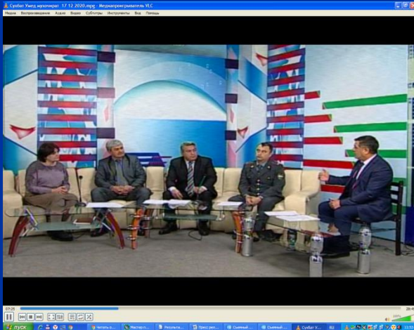
Footage from a TV program on safe migration, human trafficking, and internal migration featuring experts of NGO “Madina”, employees of Migration service, MIA, and information resource Center for Migration of GBAO broadcasted by Khorugh TV on December 16, 2020.

for Combating Organized Crime of the Ministry of Internal Affairs, and committee of youth and sports affairs were invited to discuss migration issues. The audience of more than 2,5 million people was reached by these TV and Radio programs.