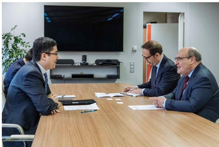
Photo: Bilateral meeting of the IOM Director General and The Head of the Permanent Mission of Uzbekistan in Geneva, June 2020. Video is available here

On July 1, in the online format was held a Special Session of the Almaty Process, dedicated to the presentation of the results of the study on the impact of COVID-19 and the negative economic situation on migration trends and remittances in Central Asia. Among others, the study touched upon such issues as: