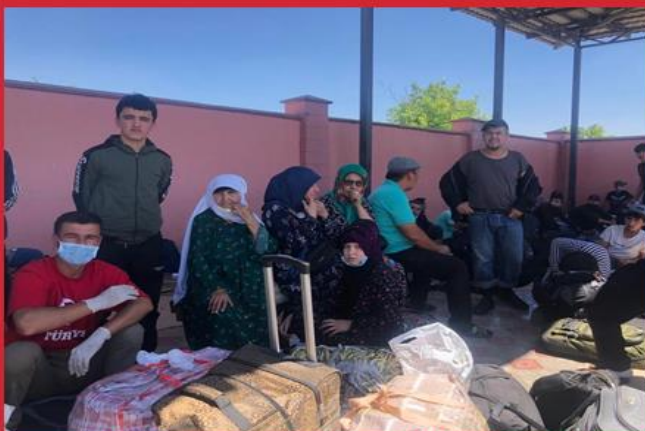
Migrants (the eldest is 92 years old) at the Kazakh-Uzbek border, June 2020.

IOM stays committed to supporting and empowering its NGO partners in delivering humanitarian and legal assistance to vulnerable migrants (VM) and victims of trafficking (VoT) inside and outside of the region.