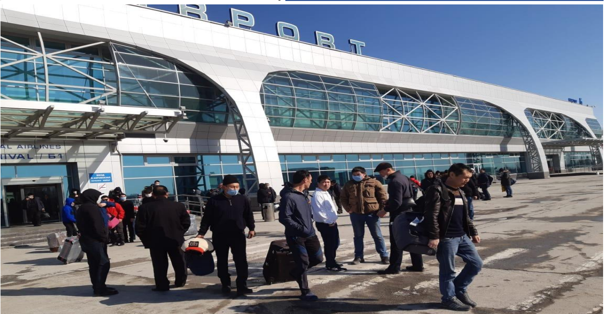
Migrants in Novosibirsk are on the way to hostels