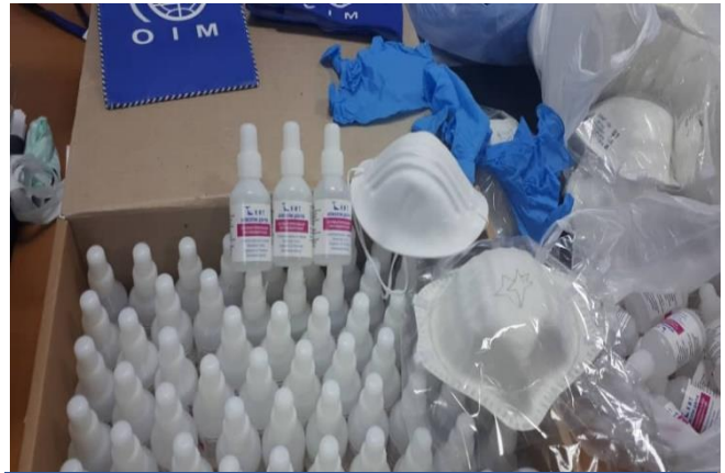
Masks, hand sanitizers, and other essentials distributed in the airport