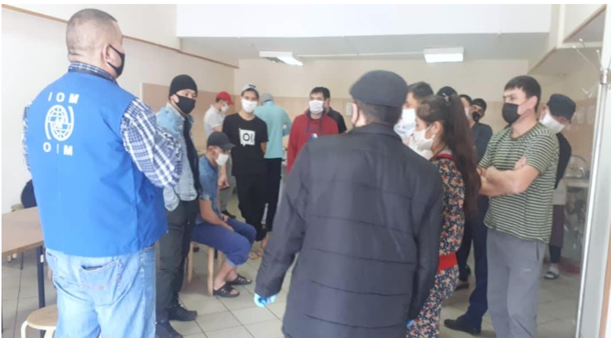
Instructions on accommodation placement and further assistance for migrants are given