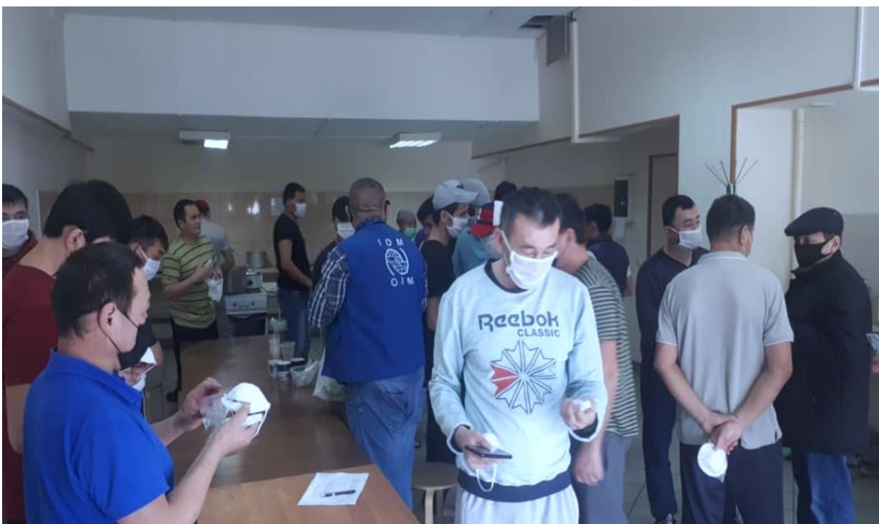
Additional face masks distributed for migrants