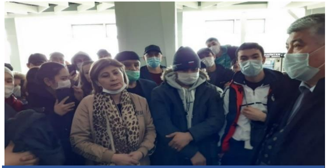
Migrants in Novosibirsk