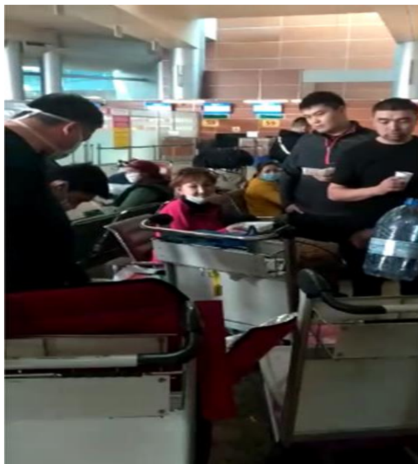
Fresh hot meals for 150 stranded migrants delivered in airport in Moscow